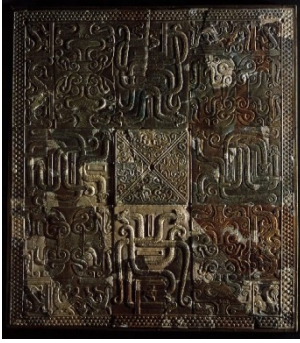
A liubo board