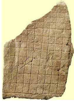
The 13x13 side of the tile board