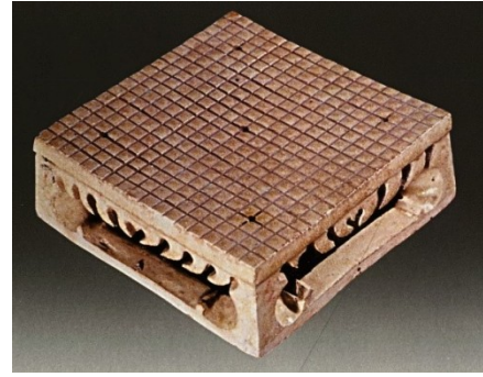
The earliest 'elegant' board (c. 600 AD)